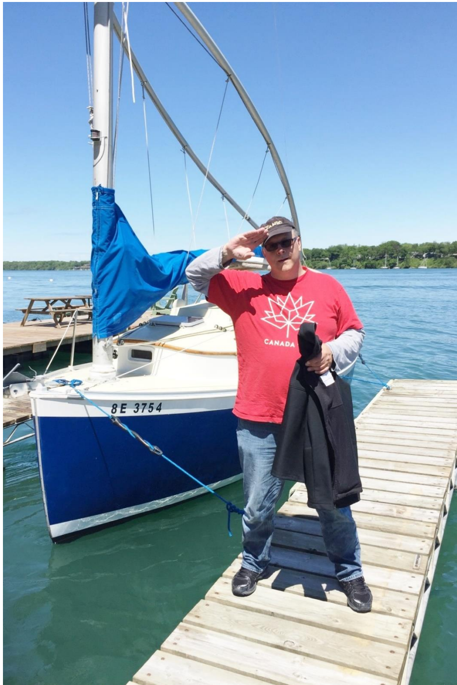
First boat in this year...just sayin'!